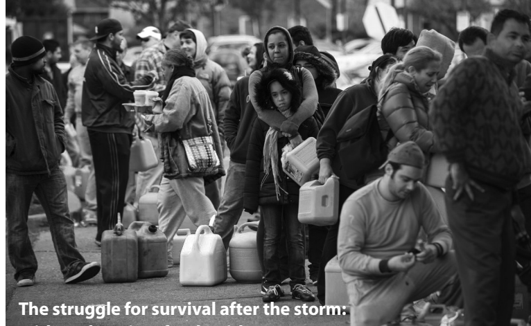
Without housing, food, utitles, gas...